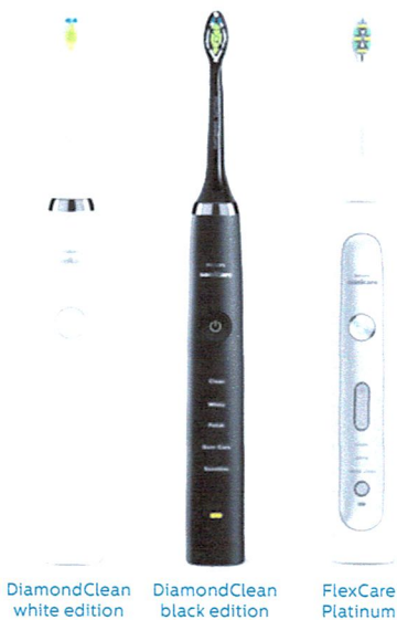
DiamondClean white edition